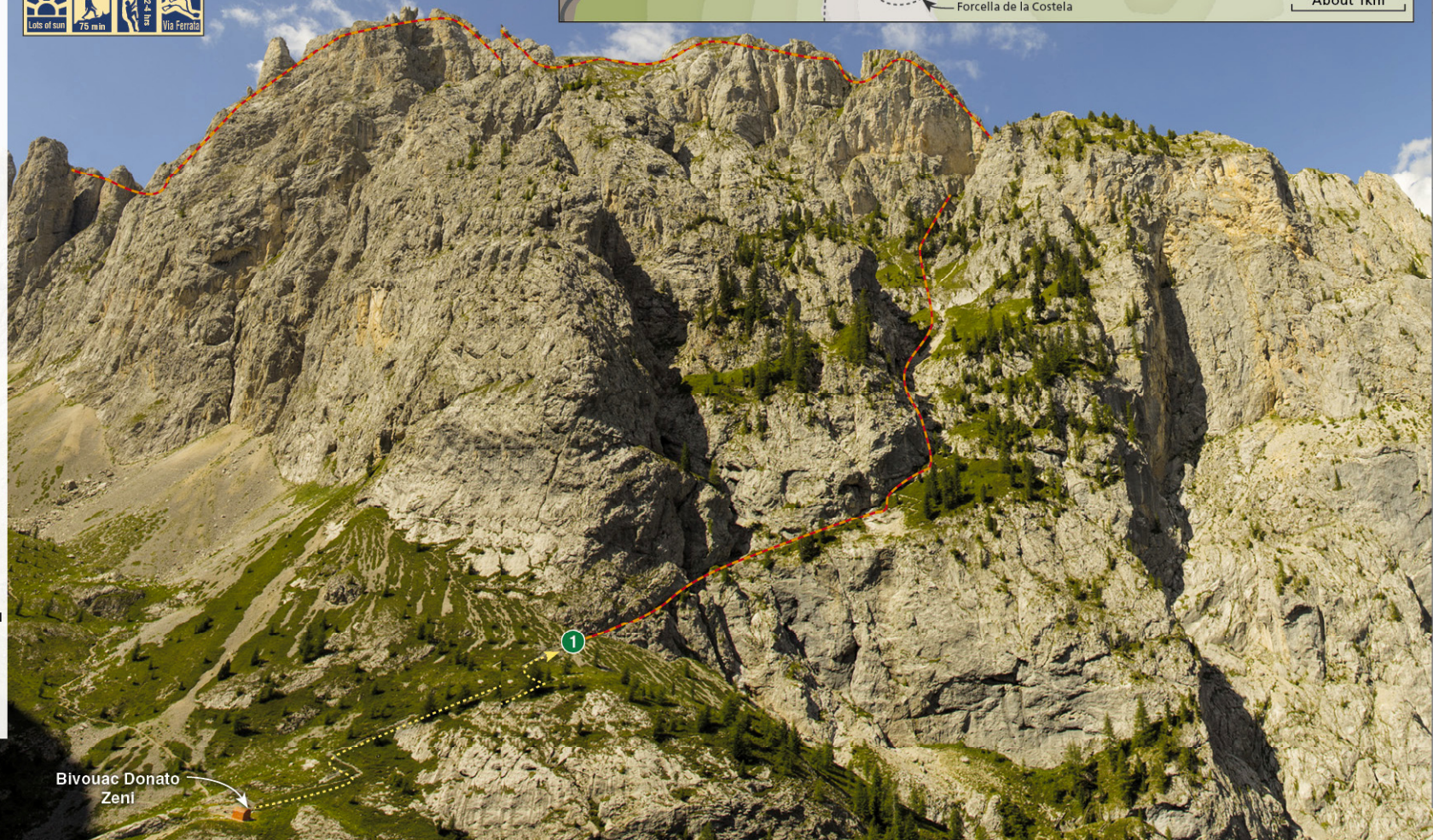
Bivouac Donato Zeni